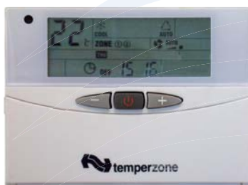
Optional SAT Wall Thermostat for non-digital systems

Materials and specifications subject to change without notice due to the manufacturer's ongoing research and development programme.